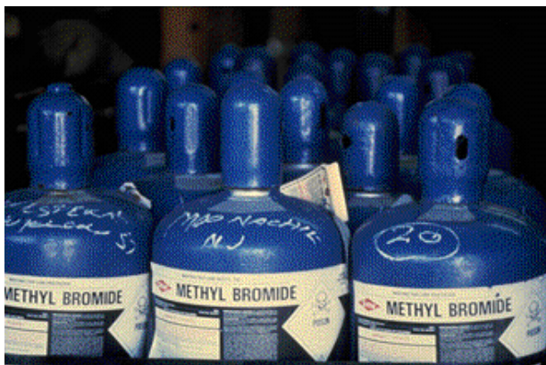
Pesticide storage tanks

Pesticide storage is key to preventing ground water contamination. If pesticides are stored in intact containers in a secure, properly constructed location, pesticide storage poses little danger to ground water. You must follow directions for storage on pesticide labels, although the