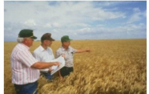
Corn - wheat- fallow rotation

Crop rotation reduces pesticide use by breaking up the pest cycle. As crops are rotated, pests such as insects and weeds cannot adapt to the changes in nutrient sources. Insects will move to another location where they can find food. Weeds will become dormant until the right condition returns. Crop rotation also increases crop yields and lowers irrigation and fertilizer cost. Pesticide rotation reduces the risk of pesticide-resistant pests. As pesticides are used year after year, pests develop immunities to them, resulting in increased application of pesticides.