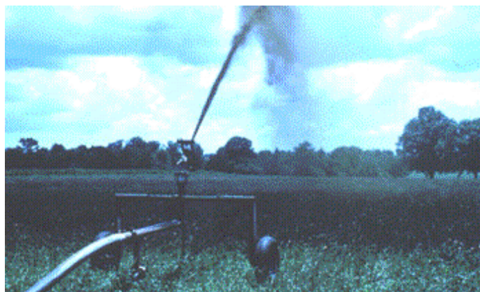
Animal waste used as fertilizer

Effective nutrient management minimizes the quantity of nutrients available for loss. This is achieved by developing a comprehensive nutrient management plan and using only the types and amounts of nutrients necessary to produce the crop, applying nutrients at the proper times and with appropriate methods, implementing additional farming practices to reduce nutrient losses, and following proper procedures for fertilizer storage and handling.